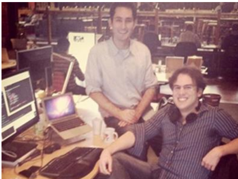
The Instagram founders

One of the more impressive, if understated, effects of Google's success has been the proliferation of entrepreneurs that spent time at Mountain View. On Quora, we saw a thread listing all the startups that have sprung from ex-Google employees. The total number was 49, which, granted, isn't an overwhelming number, but it's more than most big tech companies. We've taken a look at just 15 of these startups to highlight the kinds of companies founded by ex-Googlers.